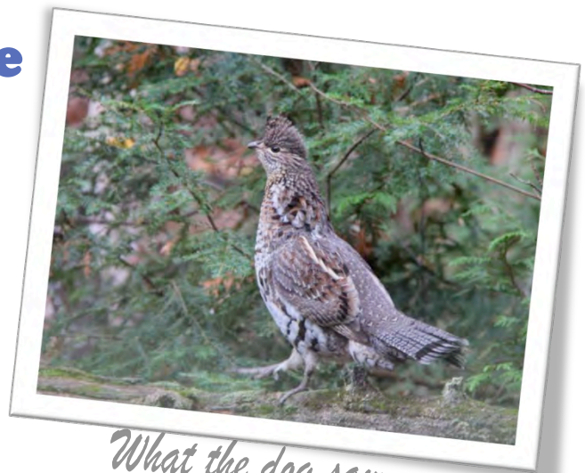
What the dog saw